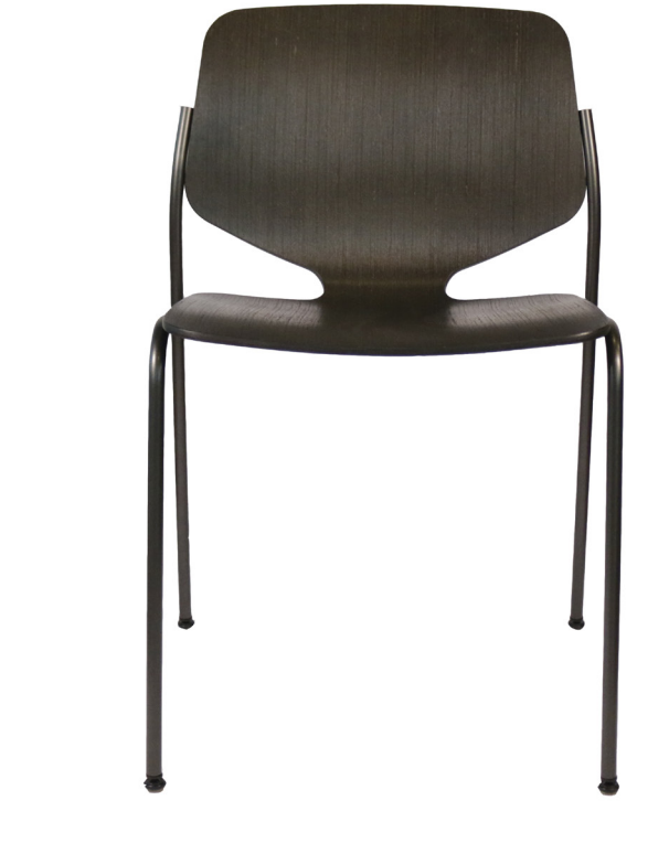
Denmark The "Nova" chair is designed 03 by ARDE design studio and manufactured by Mater Design