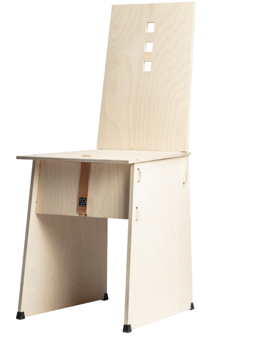
Sweden The "Join" chair is designed by 43 Sten Forsberg and manufactured by "Simply Design Sweden AB".

Sweden The "Wood" chair is designed by 42 Åke Axelsson and manufactured by "Gärsnäs"