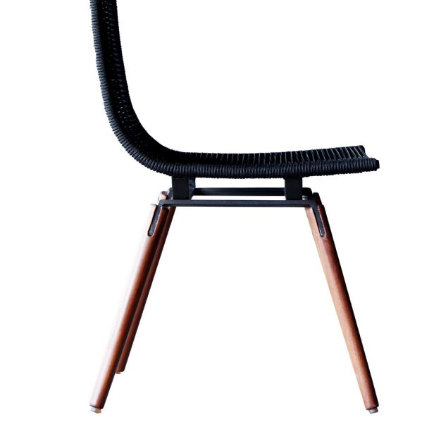
Norway The "Tropichair" is designed 36 by Jacob Amtorp and manufactured by "DAFI Tropic Furniture Factory"